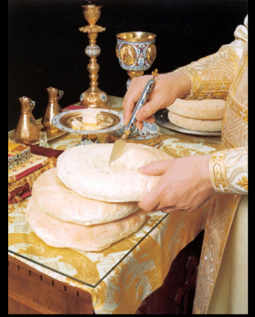
"Thine own from Thine own we offer to Thee, in all and for all"